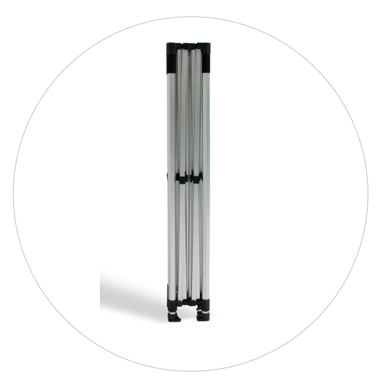
(qty 1) Canopy Frame Frame