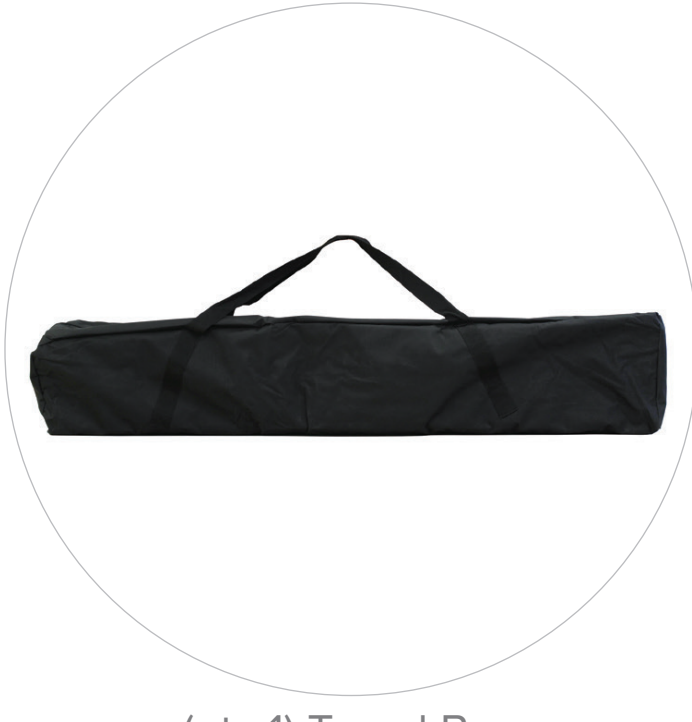
(qty 1) Travel Bag